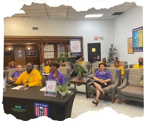
Shreveport Job Corps Center DEIA Team